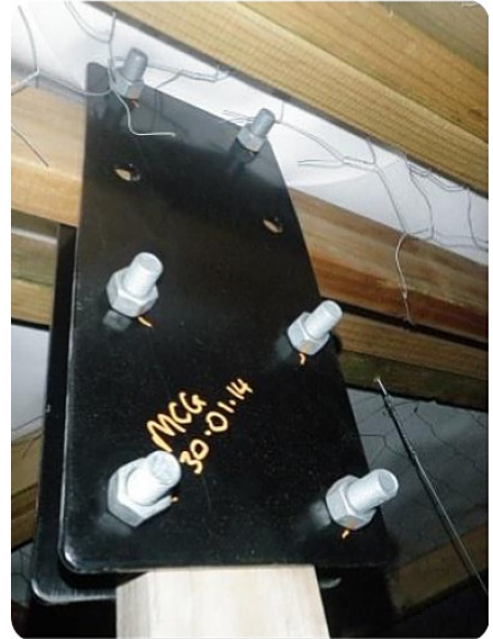
Proof of attachment for documentation