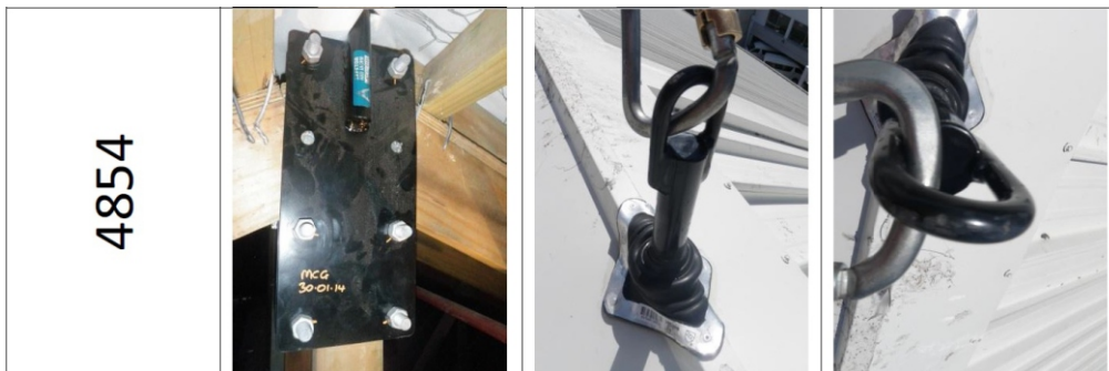
Photo above showing serial number of anchor, SE008HP anchor clamped to web in truss. Dektite flashing fixed in place.