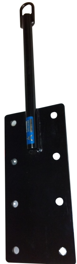
Safetor SE008HP anchor